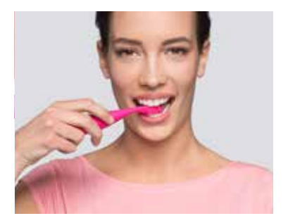
BRUSH Brush your teeth using wide circular motions for 2 minutes; 30 seconds in each quadrant of the mouth.